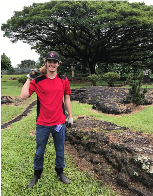
UH-Hilo students and Master gardeners help with weeding and cleaning chores