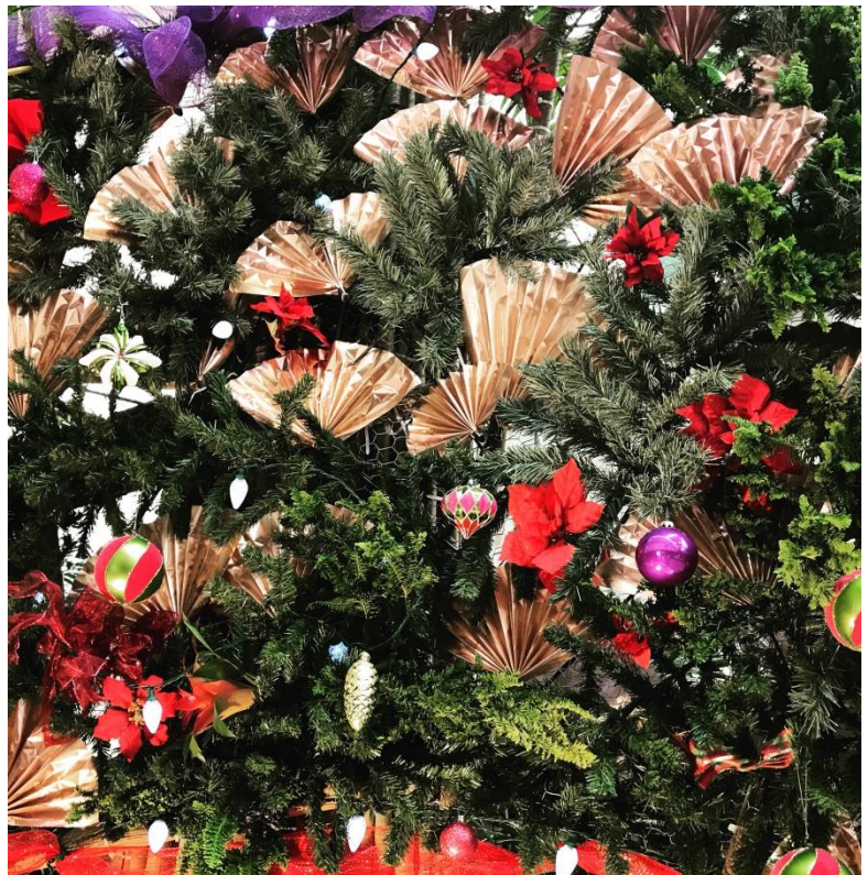
Magic of the Season makes use of the Gannenmono bamboo structure.